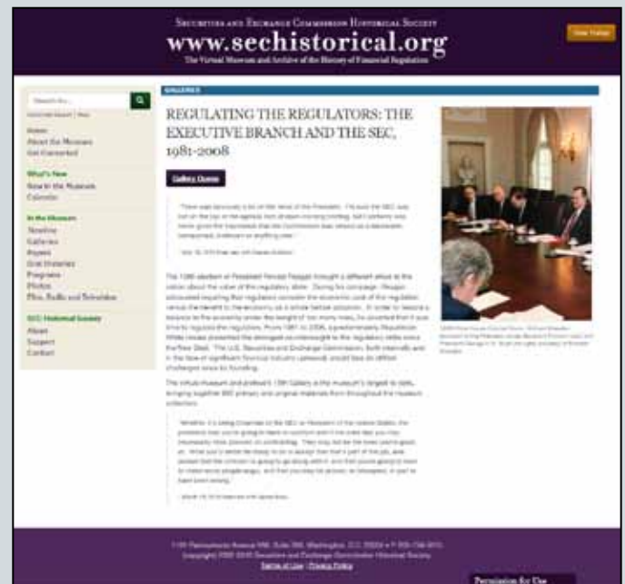
Virtual Museum and Archive at www.sechistorical.org , 2016