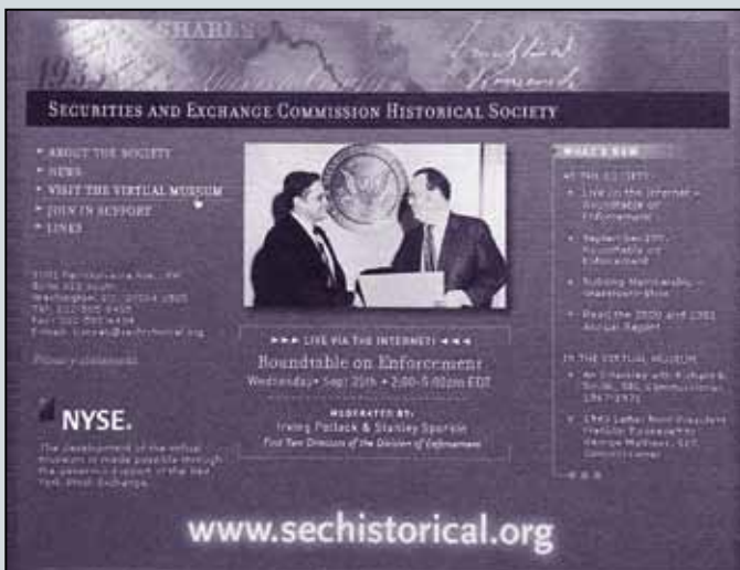
Virtual Museum at www.sechistorical.org , 2002